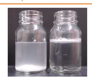
Non Treated SERICITE